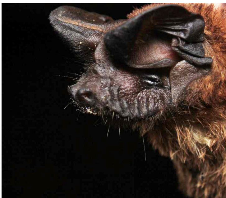
Figure 2 Chaerephon johorensis captured in Belukar Bukit, Hulu Terengganu, Terengganu.

A female C. johorensis (Field No: BBK15 050) was mist-netted from canopy mist net at the height of 20.65 m from the forest floor (Figure 2 and 3). We also managed to record another ten species of bats; Balionycteris maculata , Cynopterus brachyotis , Cynopterus horsfieldi , Eonycteris spelaea , Macroglossus sobrinus , Megaerops ecaudatus , Megaderma spasma , Penthetor lucasi , Rhinolopus affinis and Rhinolophus lepidus . The measurements ranges of C. johorensis based from Francis (2008) are FA: 44-49, T: 36-43 and Wt: 15-25 g. The external measurements of C. johorensis in this study are FA: 45.36, E: 11.36, TB: 16.65, HF: 10.51, T: 34.02, HB: 64.35 and Wt: 20.6 g.