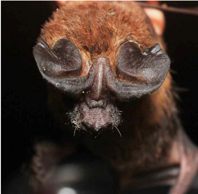
Figure 3 Pouched at the back of Chaerephon johorensis .