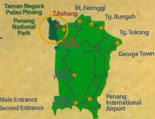
Peta ke Pintu Masuk ke-2 Map to Second Entrance (Kuala Sungai Pinang)